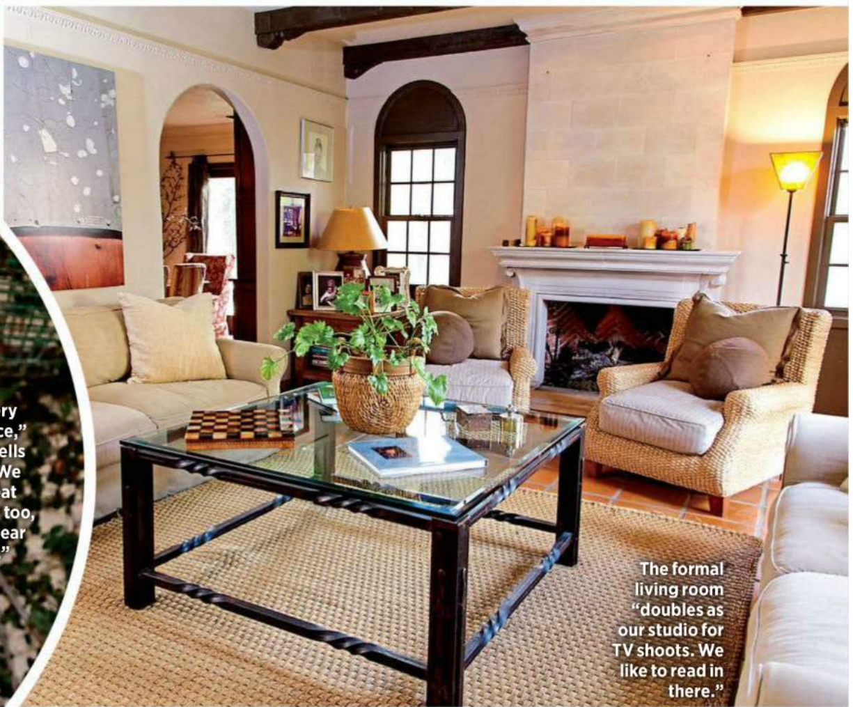
The formal living room "doubles as our studio for TV shoots. We like to read in there."